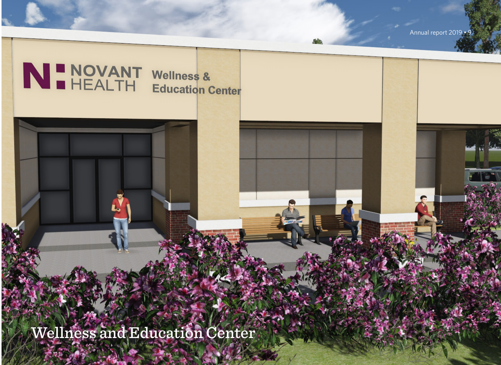
Wellness and Education Center

After more than 85 years of serving the Davidson County community, Novant Health Thomasville Medical Center is ready to develop a place that will inspire and educate people of all ages. Right here in our region, diabetes, behavioral health and outpatient rehabilitation continues to impact the lives of thousands of patients and their families each year.